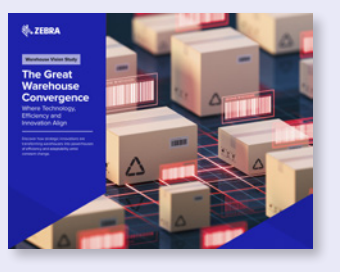
The Great Warehouse Convergence Where Technology, Efficiency and Innovation Align

To view the entire Warehouse Vision Study series, visit zebra.com/warehousingvisionstudy