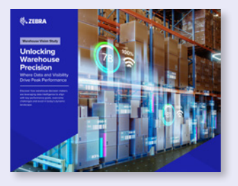
Unlocking Warehouse Precision Where Data and Visibility Drive Peak Performance