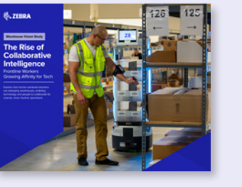
The Rise of Collaborative Intelligence Frontline Workers Growing Affinity for Tech