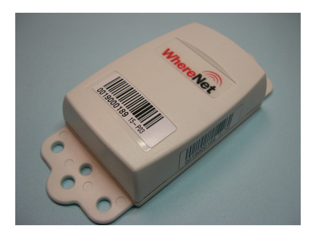
105.1mm x 43.6mm x 19.3mm