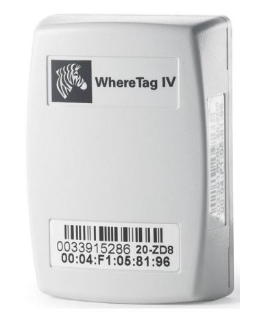
66.0mm x 43.7mm x 21.3mm