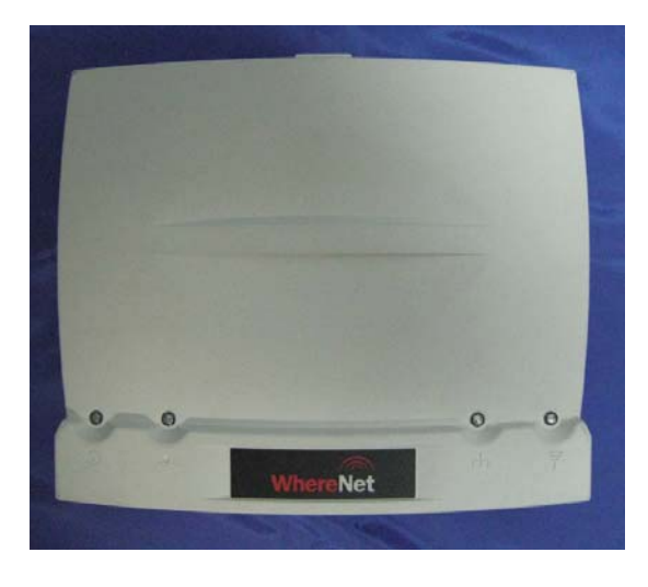
26.7 cm x 29.2 cm x 8.2 cm