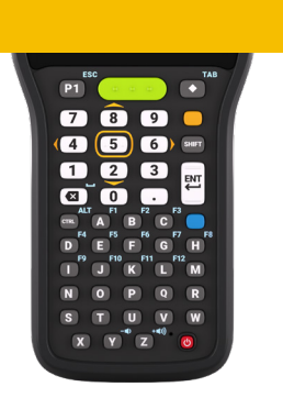
Alpha-Numeric (47 key)

Choose the keypad that best suits the type of data your workers need to capture