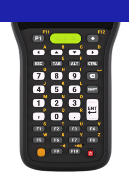
Function Numeric (38 key)