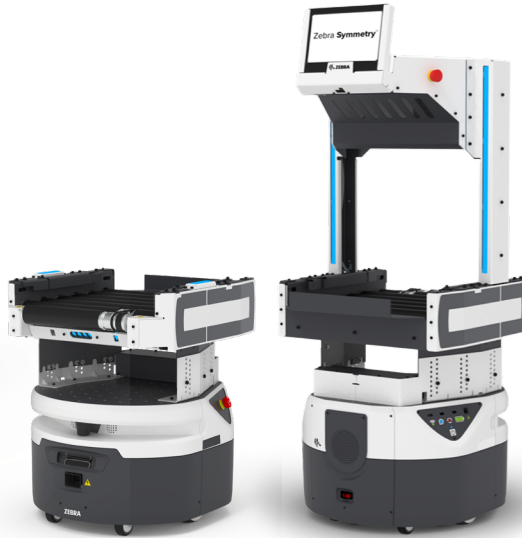
Zebra Roller Series Integrate with current conveyor infrastructure