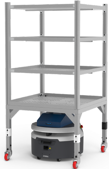
Zebra Connect Automatically pick up and drop off carts up to 125 lbs. (57 kg)