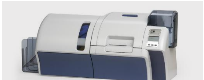
ZXP Series 8