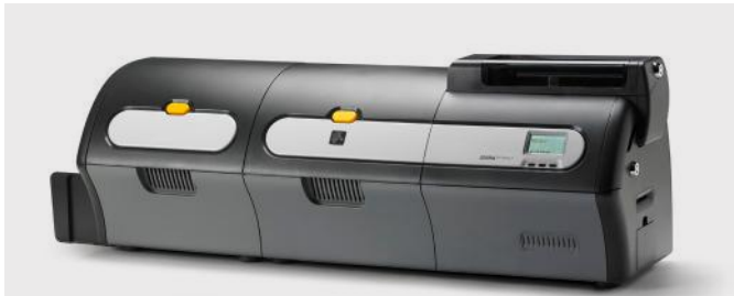
ZXP Series 7

Zebra offers two card printers with lamination capabilities: the ZXP Series 7 and ZXP Series 8.