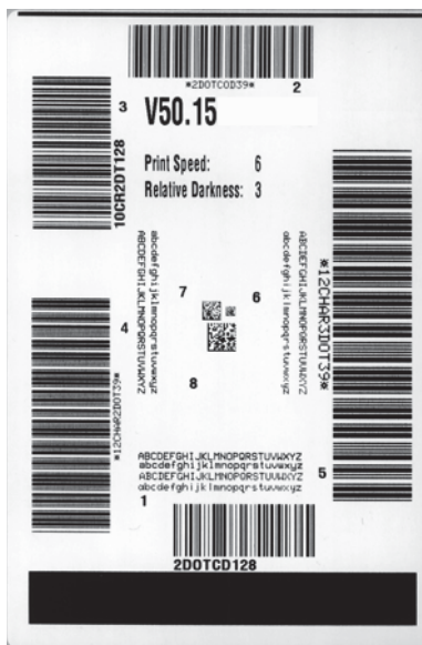
Figure 4 • FEED Test Label

The printer prints a series of labels (Figure 4) at various speeds and at darkness settings higher and lower than the darkness value shown on the configuration label.