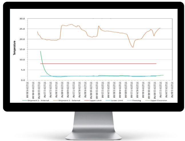
Shipment 2: AON-IN-Temperature Profile (24hrs)

Test results demonstrated that the AON Pharmacy small shipping boxes are capable of providing the desired temperature environment for shipment of temperature sensitive products, maintaining temperature within 2°C to 8°C for a minimum of 24 hours.