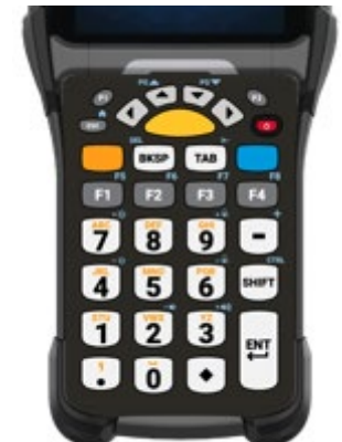
29 Key Function