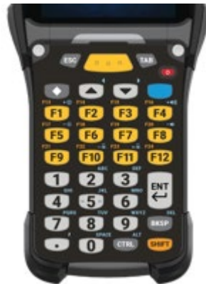
34 Key Function