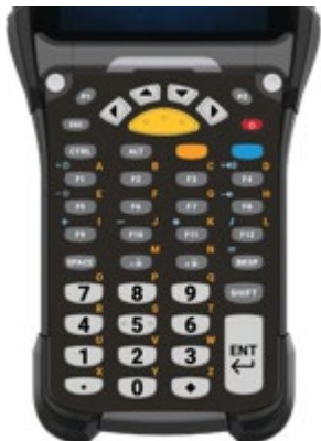
43 Key Function