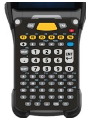
58 Key Func AN